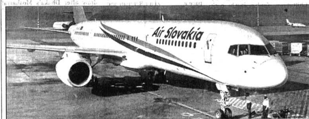
An aircraft of Air Slovakia prepares to take off at Zia International Airport in Dhaka yesterday as the airline started its Bangladesh operations.

The Daily Star and Channel i are the media partners of the event, which ends today.