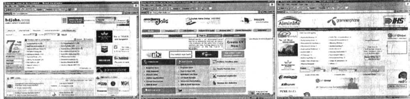
The home pages of three job portals -- bdjobs, Prothom-Alojobs and Aiminlife. The number of job portals is on the rise. Over 10 job and career portals are now in operation in Bangladesh, up by more than 100 percent from last year.