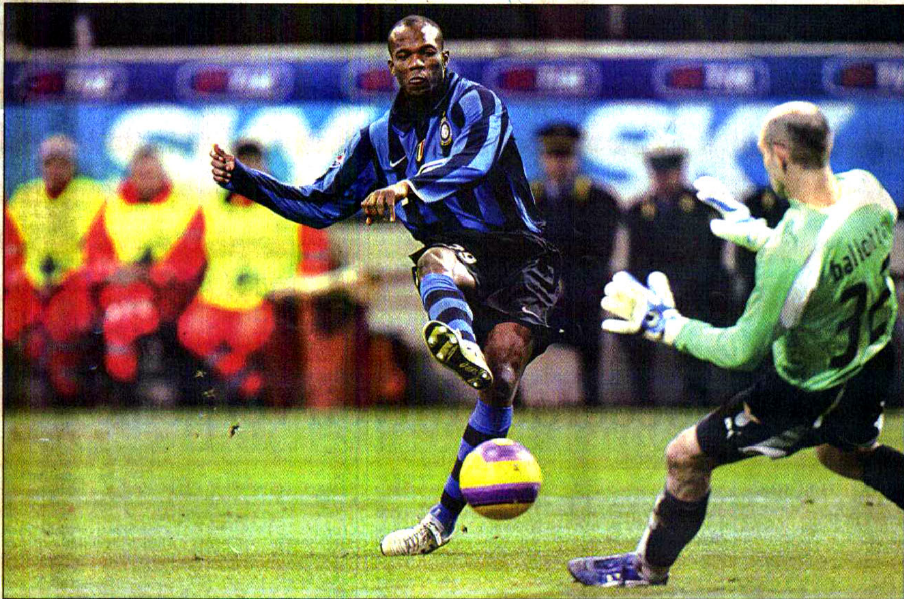
Inter Milan striker David Suazo (L) slots the ball past Lazio goalkeeper Ballotta to score during their Serie A encounter at the San Siro on Wednesday.