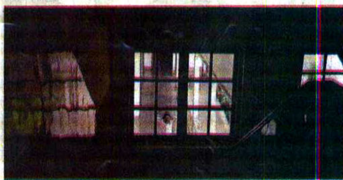
A photograph at the exhibition

It is tightrope walking for him to balance his job with his passion for photography. However, as he says he has to squeeze out time to combine both. It is a measure of his commitment to his art that he spares every available moment on it. Here's to many more shows such as this -- not just in India but all over the world.