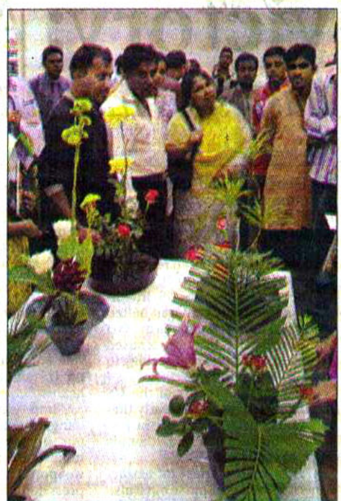
Ikebana demonstration at the programme

The programmes were organised by the Embassy of Japan in association with Japan Bangladesh Chamber of Commerce and Industry (JBCCI), Meghdut and Bangladesh Shilpakala Academy.