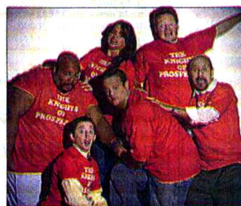
The Knights of Prosperity On Star World at 9:00 pm TV Series Cast: Donal Logue, Sofia Vergara

All programmes are in local time. The Daily Star will not be responsible for any change in the programme.