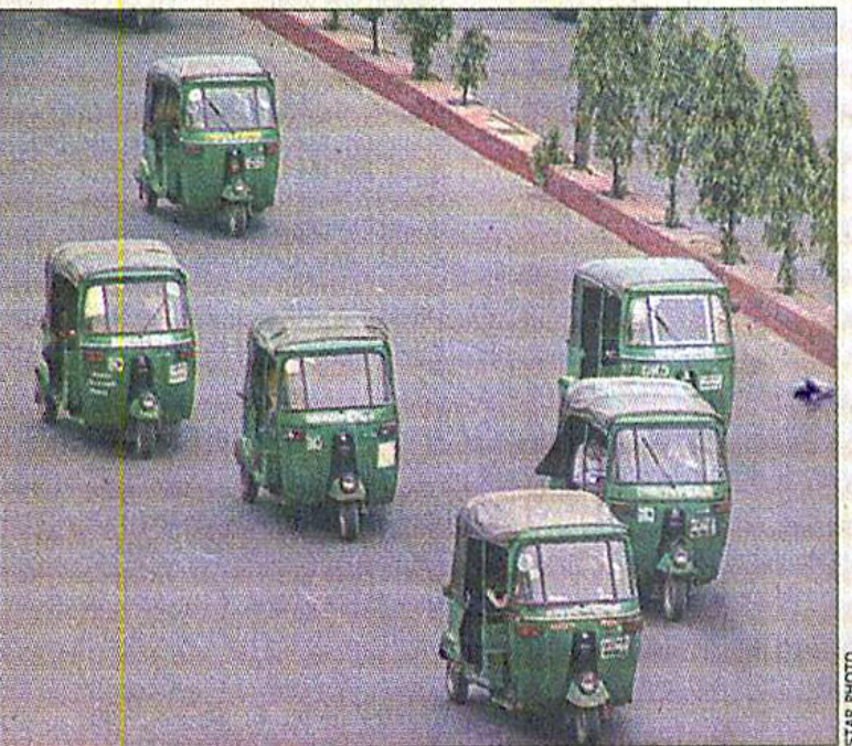
CNG-run auto-rickshaws in the port city.