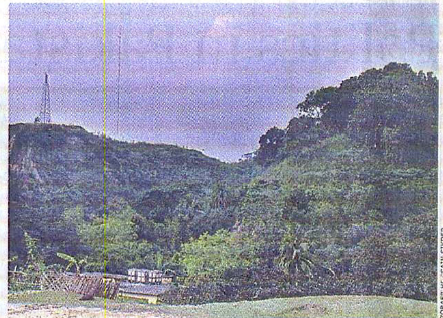
Firoze Shah Hill in Pahartali area, top, Cantonment Hill in Bayezid Bostami area, bottom left, and Batali Hill, bottom right.