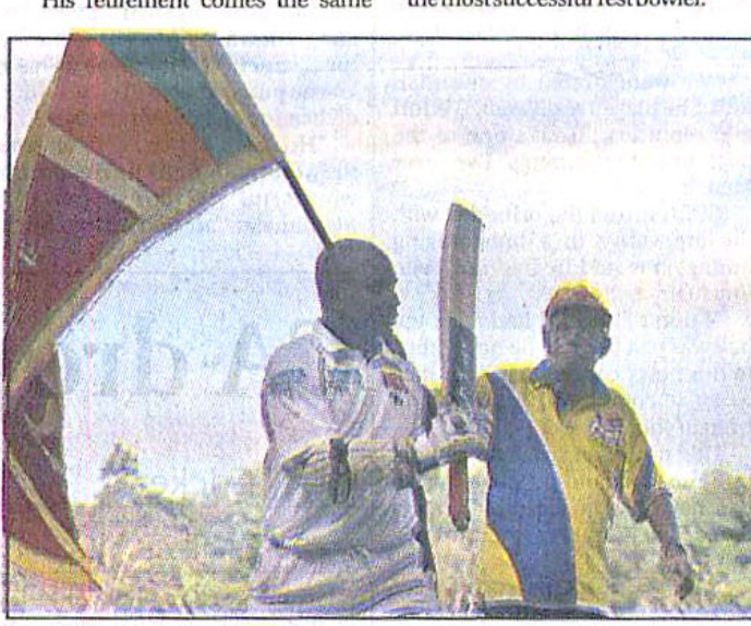
HIS LAST HURRAH: A Sri Lankan fan escorts batsman Sanath Jayasuriya as he leaves the ground after being dismissed on his personal score of 78 on the third day of the first Test against England at Asgiriya Stadium in Kandy yesterday. Jayasuriya afterwards disclosed that it was his last Test innings.

and played his first Test against New Zealand in Hamilton in February 1991. His retirement comes the same day teammate Muttiah Muralidaran overtook Australian Shane Warne's world record of 708 wickets to become the most successful Test bowler.