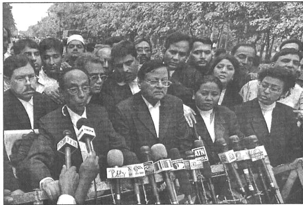
Awami League Acting President Zillur Rahman briefs journalists near sub-jail after appearing before a court in the city as lawyer for detained AL President Sheikh Hasina yesterday. (Story on Page 1)

"Security forces have arrested 13 members of the group including teachers, accountants and students while they were holding a meeting in the (southern Egyptian) city of Sohag," the source said.