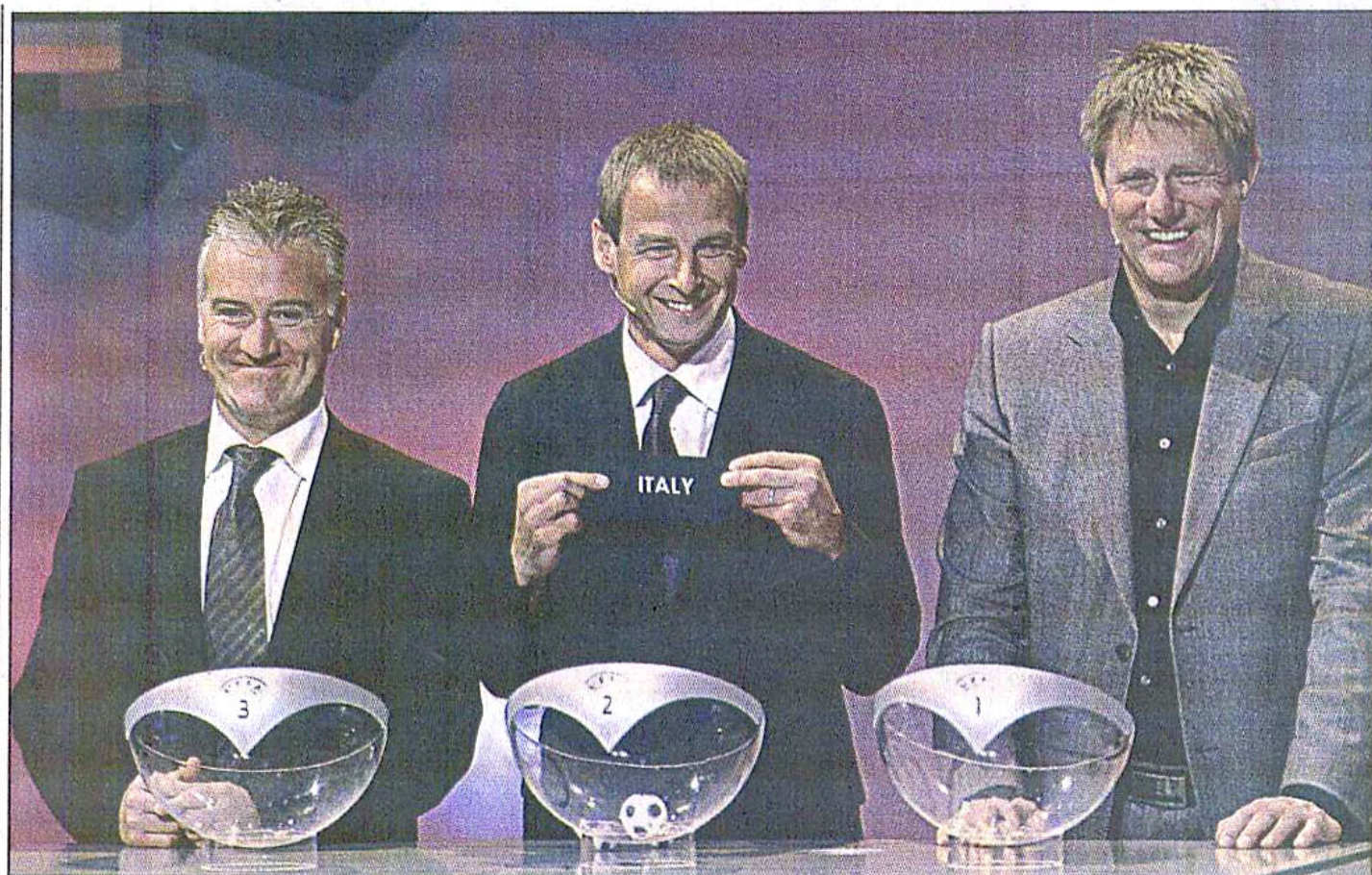
German legend Juergen Klinsmann (C) is all smiles as he holds Italy's ballot paper next to Didier Deschamps (L) of France and Peter Schmeichel of Denmark during the Euro 2008 final draw in Lucerne on Sunday.