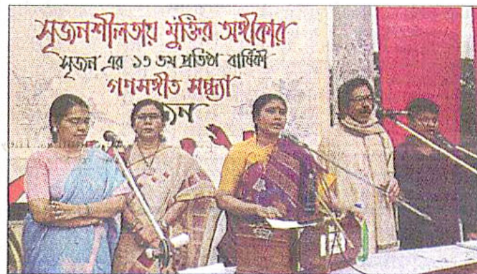
Artists perform at Srijon's anniversary celebration