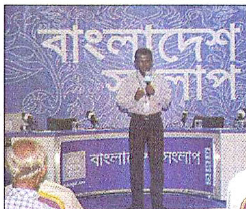
BBC Bangladesh Shanglap On Channel 1 at 7:50 pm Discussion programme on contemporary issues