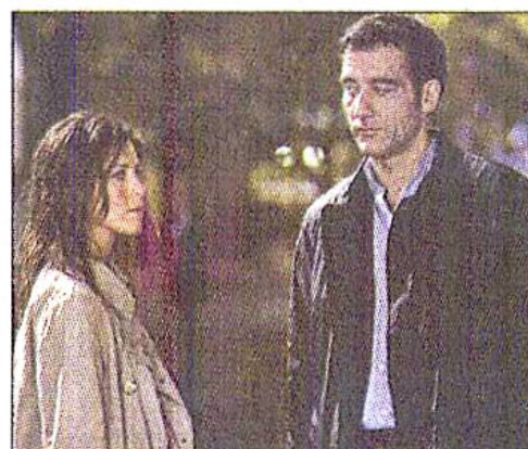
Derailed On Star Movies at 7:00 pm Genre: Drama Cast: Clive Owen, Jennifer Aniston

All programmes are in local time. The Daily Star will not be responsible for any change in the programme.