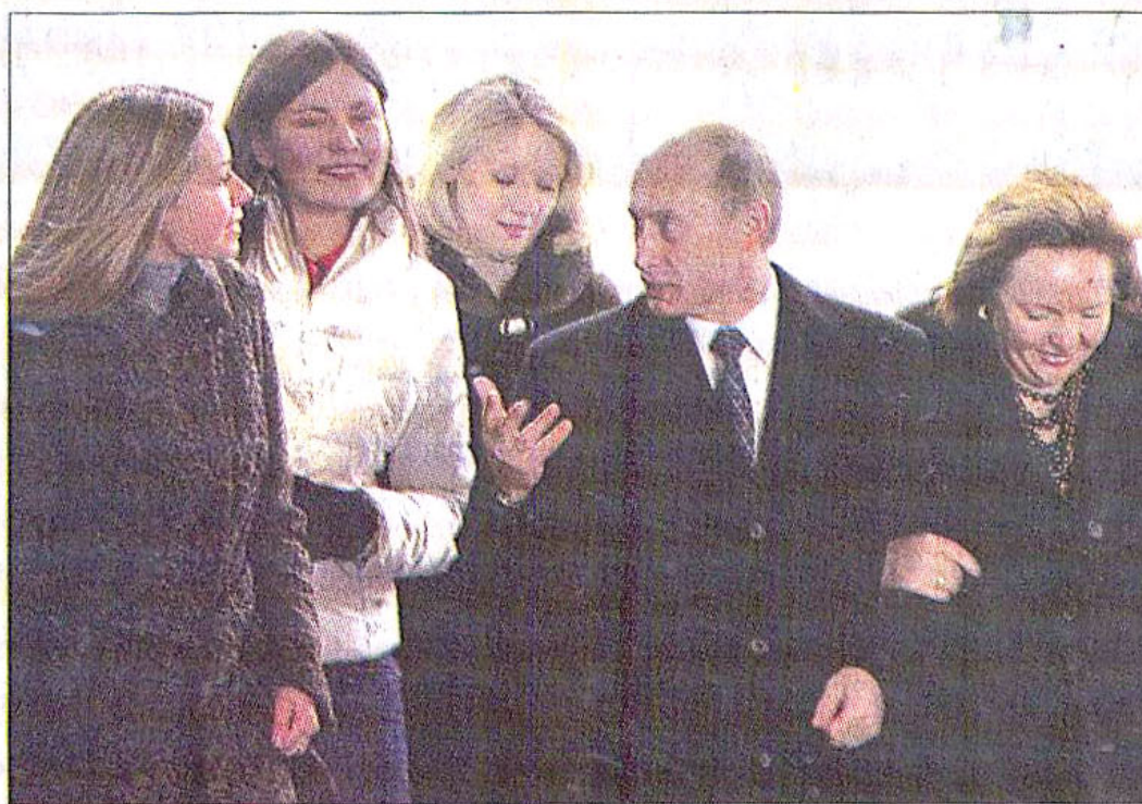
Russian President Vladimir Putin (2R) and his wife Ludmila (R) speak with voters while entering a Moscow polling station yesterday to cast their votes in Russia's parliamentary elections. Several people at the polling station applauded Putin.

The Rafah terminal with Egypt - Gaza's only border crossing that bypasses Israel - has been closed since the Hamas takeover, and the only way for people to move between Gaza and Egypt has been when Israel has allowed people to be taken by bus between Erez and El-Oja.