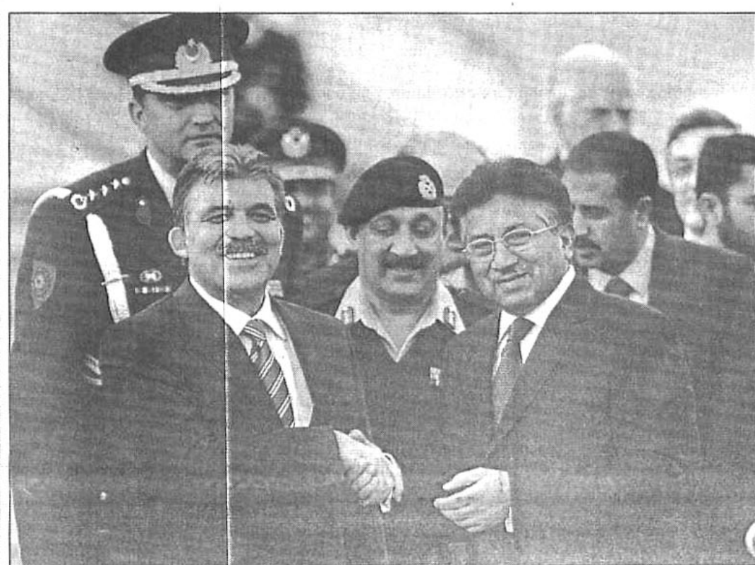
Turkish President Abdullah Gul (L) shakes hands with his Pakistani counterpart Pervez Musharraf (R) upon his arrival at Chaklala military airbase in Rawalpindi yesterday. Gul arrived in Pakistani capital, becoming the first foreign leader to do so since the declaration of emergency rule.

The train will leave Munsan in the South at 9:00 am (0000GMT) and reach Bongdong in the North before returning to Munsan at 2:00 pm, it said.