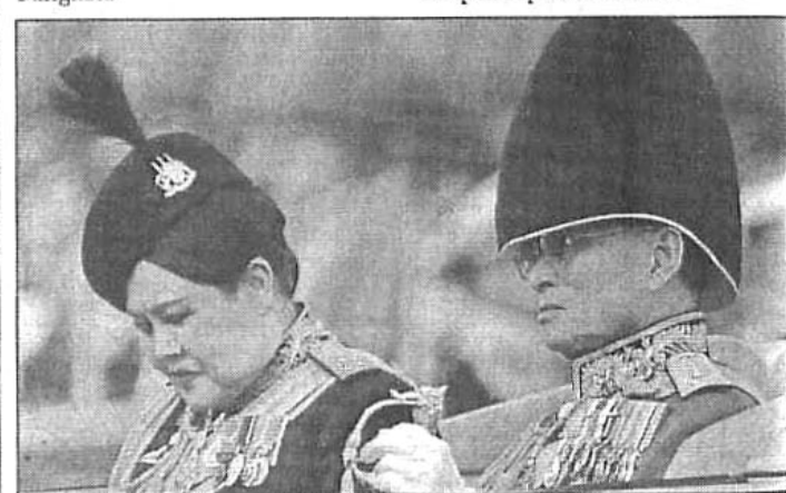
Thai King Bhumibol Adulyadej (R) and Queen Sirikit review the honour guard as a part of a celebration to commemorate his 80th birthday at the Royal Plaza in Bangkok yesterday. Thailand's King Bhumibol Adulyadej, world's longest-reigning monarch celebrates his 80th birthday on December 5.

"I am requesting the army and every walk of Thais to ask whether our nation is important enough," the king told more than 2,000 military officers at a parade in central Bangkok.