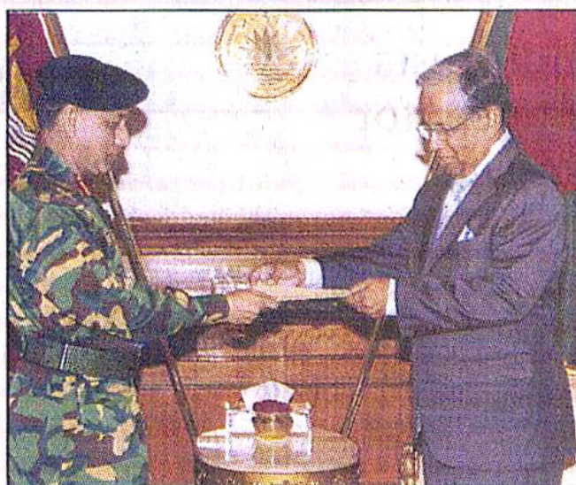
Army Chief Gen Moeen U Ahmed hands over a cheque for Tk 50 lakh to Chief Adviser Fakhruddin Ahmed at the latter's office in the city yesterday on behalf of the army and Trust Bank Ltd for the cyclone victims. (Story on Page 2)

Fax: 880 2 8828272 E-mail: asset@agni.com