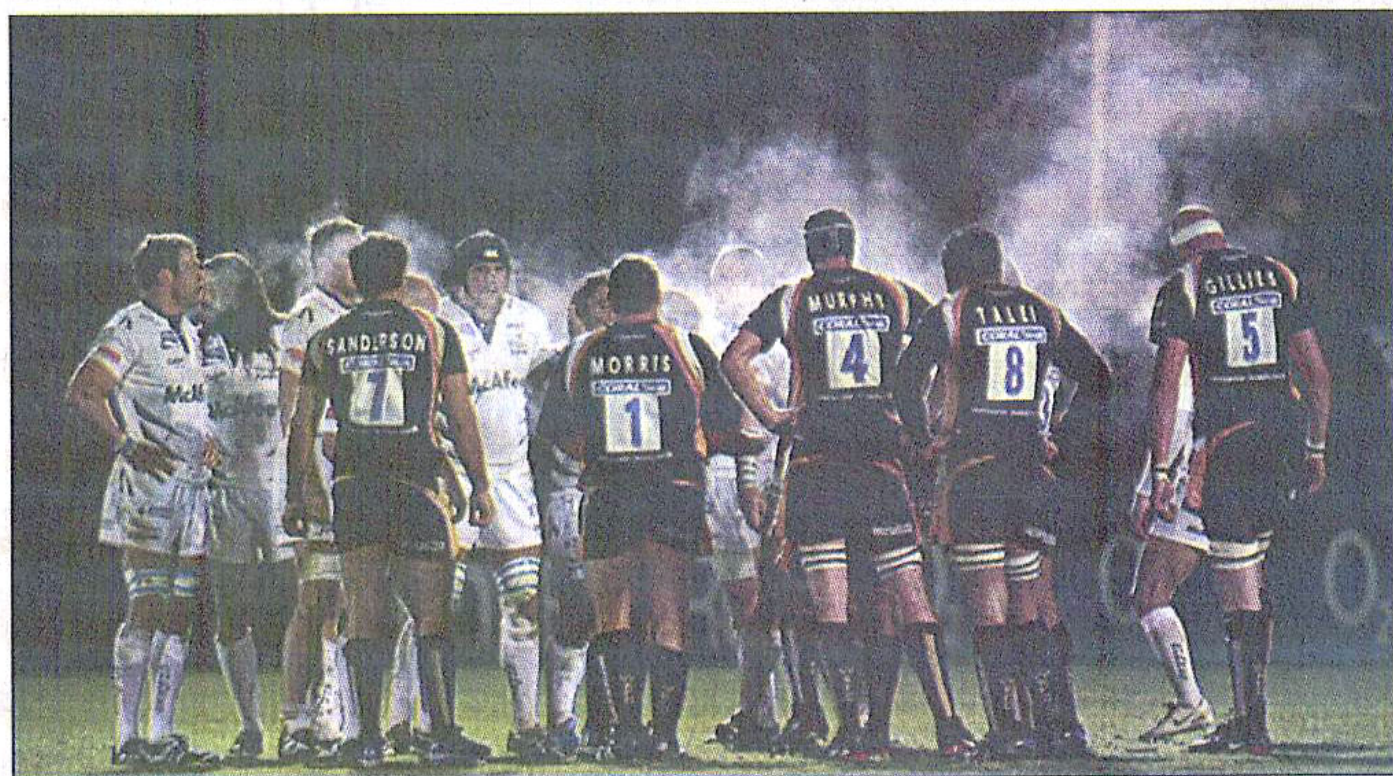
STEAM BATH IN THE COLD: The chilling cold is evident at Sixways as Worcester and Sale players work up a head of steam during their Guinness Premiership match on November 24.