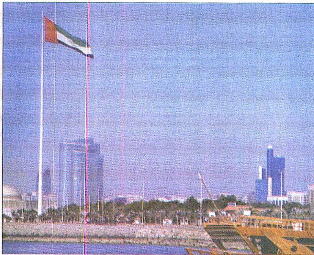
Abu Dhabi: World's tallest unsupported flagpole with flag measuring 20 by 40 metres.

the knowledge that the fundamental strengths of the national economy, coupled with a wise leadership, will continue to permit them to record another year of progress and development.