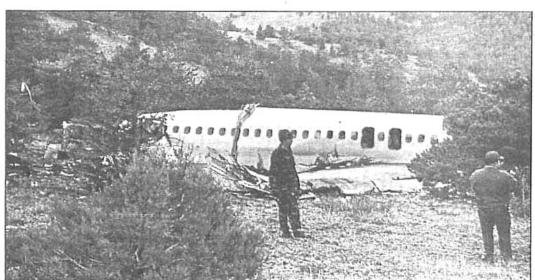
Turkish soldiers stand at the site where an airplane crashed in the southwestern province of Isparta yesterday. A Turkish plane carrying 56 people crashed, as it was preparing to land in the southwestern province of Isparta.

At least 21 people were killed, including two who died in hospital on Thursday and a suicide bomber, while more than 40 were injured in Wednesday's blasts.