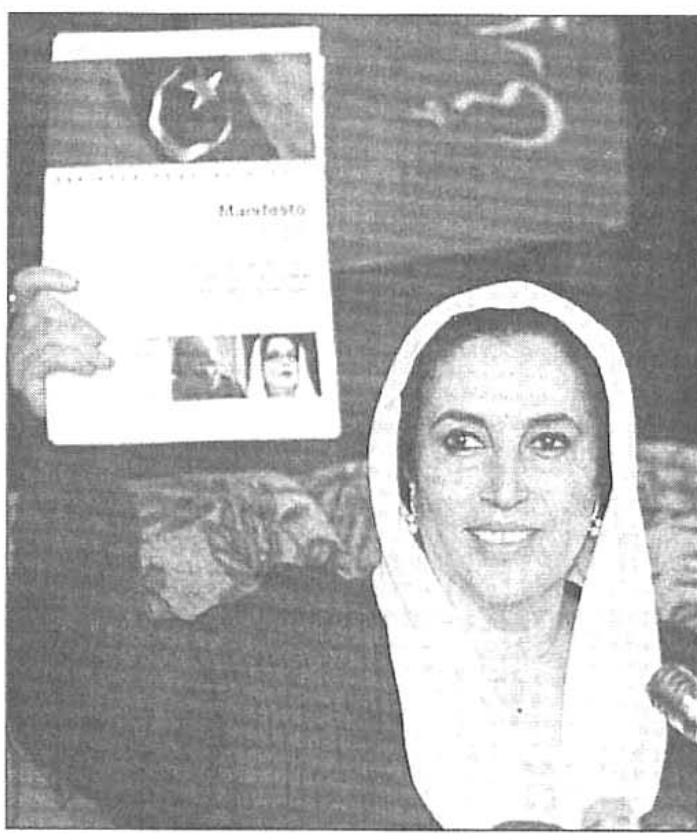
Former Pakistani prime minister Benazir Bhutto smiles as she shows a copy of her party manifesto during a press conference in Islamabad yesterday. Pakistani opposition leader Benazir Bhutto launched her party's manifesto for elections on January 8, but reiterated that she was taking part in the polls under protest.

"I did not meet General Musharraf yesterday. We have already denied it," she said.