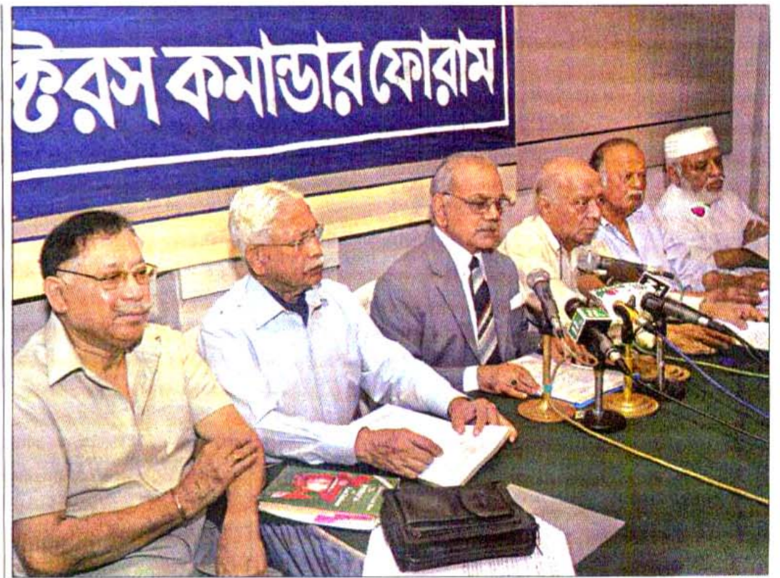
The Sectors Commander Forum comprising the sector commanders of the Liberation War holds a press conference at the Liberation War Museum in the capital yesterday. (Story on page 1)