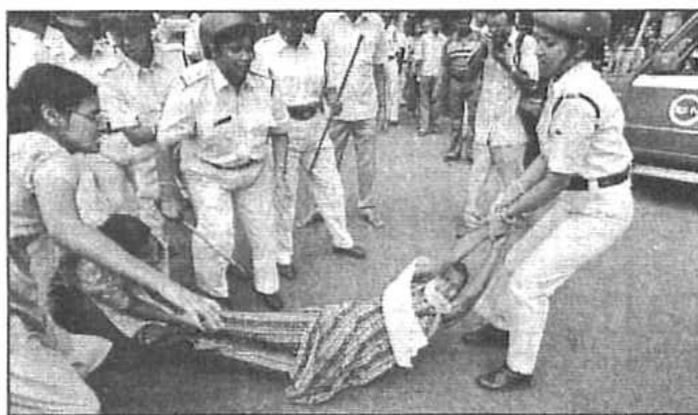
Activists of the Socialist Unity Centre of India (SUCI) scuffle with police as a woman is detained by law enforcers during a demonstration in Kolkata yesterday, in support of a state wide general strike. The strike was called by the SUCI to protest against what was termed as the state government's 'failure' to restore peace at Nandigram, check price hike, and punish corrupt ration dealers, Press Trust of India said.

Prof. Ataur Rahman Choudhury Principal Dhaka National Medical College