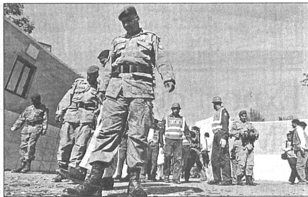
Pakistani investigators gather evidence at the site of a suicide attack in Rawalpindi yesterday. A suicide bomber blew himself up near Pakistani President Pervez Musharraf's army headquarters in the garrison city of Rawalpindi on October 30 killing seven people, officials said.