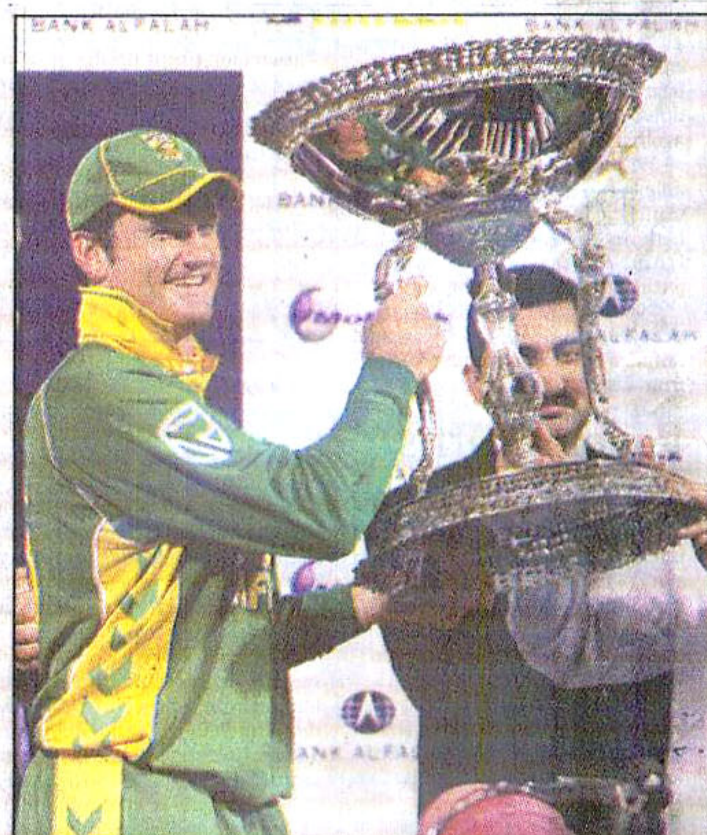
THANKS FOR A NICE LITTLE GIFT: South Africa captain Graeme Smith holds the winners' trophy at the Gaddafi Stadium in Lahore yesterday after defeating Pakistan by 14 runs in a dramatic finish of the fifth and final one-day international.