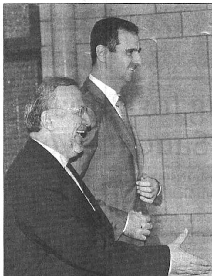
Iranian Foreign Minister Manouchehr Mottaki laughs as he is greeted by Syrian President Bashar al-Assad (back) and other Syrian officials at al-Shaab palace in Damascus yesterday.

The Maoists are calling for a vote on whether the monarchy should be scrapped immediately and to change the proposed voting system.