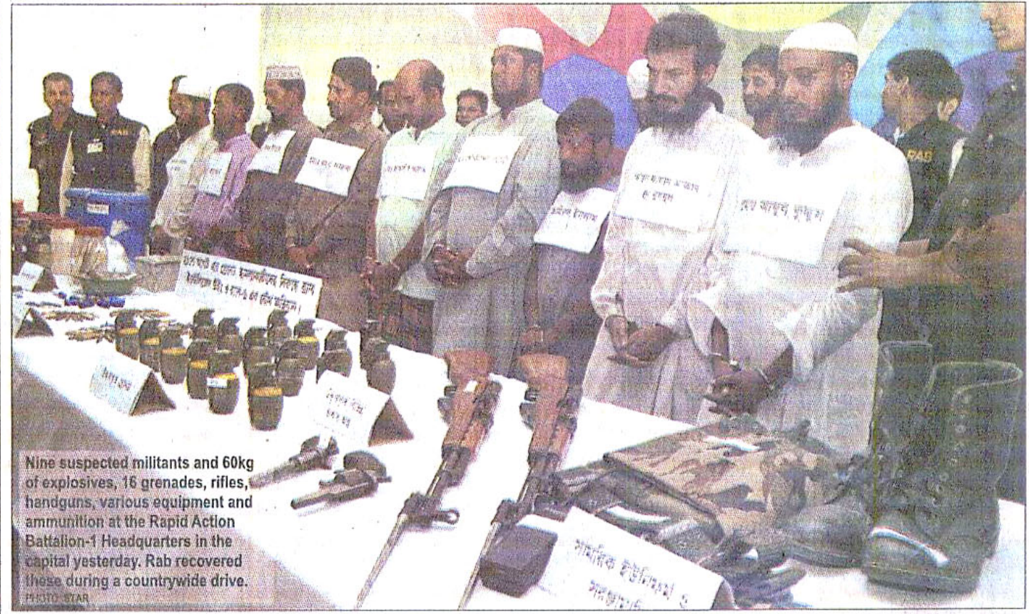
Nine suspected militants and 60kg of explosives, 16 grenades, rifles, handguns, various equipment and ammunition at the Rapid Action Battalion-1 Headquarters in the capital yesterday. Rab recovered these during a countrywide drive.