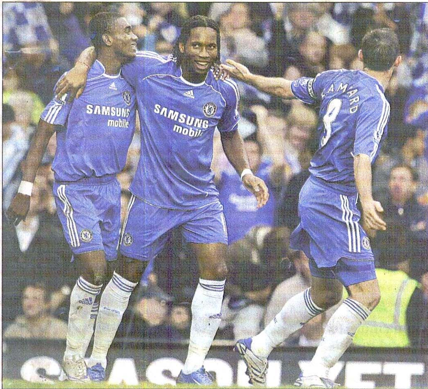
Chelsea star striker Didier Drogba (C) is congratulated by teammates Salomon Kalou (L) and Frank Lampard after scoring the third goal during their Premiership match against Manchester City at Stamford Bridge on Saturday.