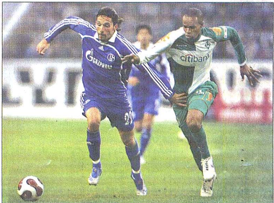
Schalke striker Kevin Kuranyi (L) squirms away from Werder Bremen defender Naldo during their Bundesliga encounter at the Arena Auf Schalke in Gelsenkirchen on Saturday.

"I have a house here, my daughter is settled in school and we love it in England."