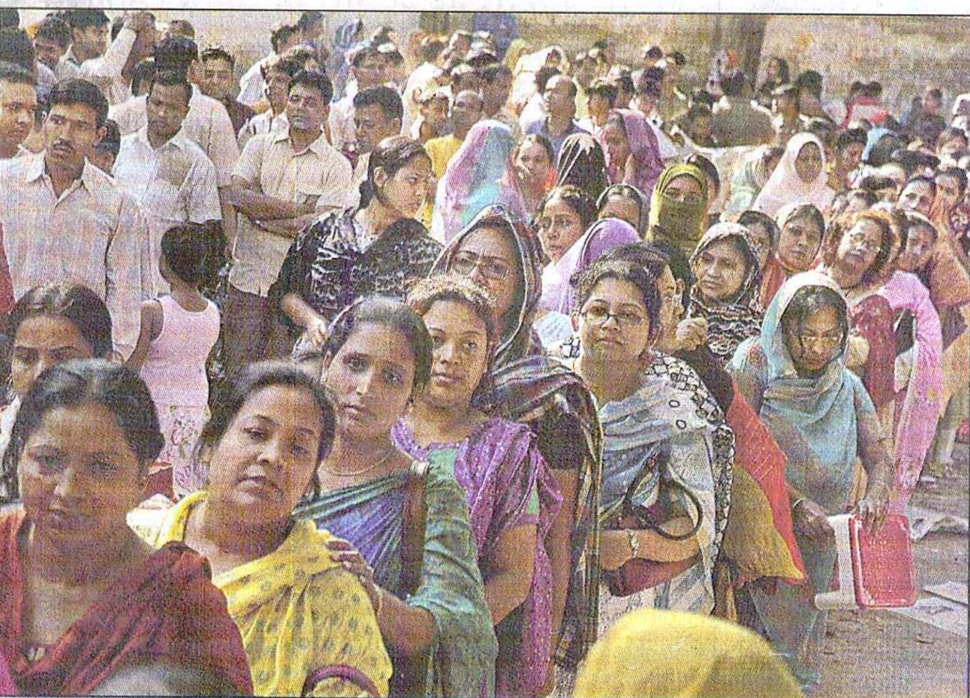
Guardians wait in queues for hours to collect admission forms for their children for English medium section on the Vigarunnessa Noon School campus in the city yesterday.

Reputed engineers highlighted the importance of collaboration of the industries with the university.