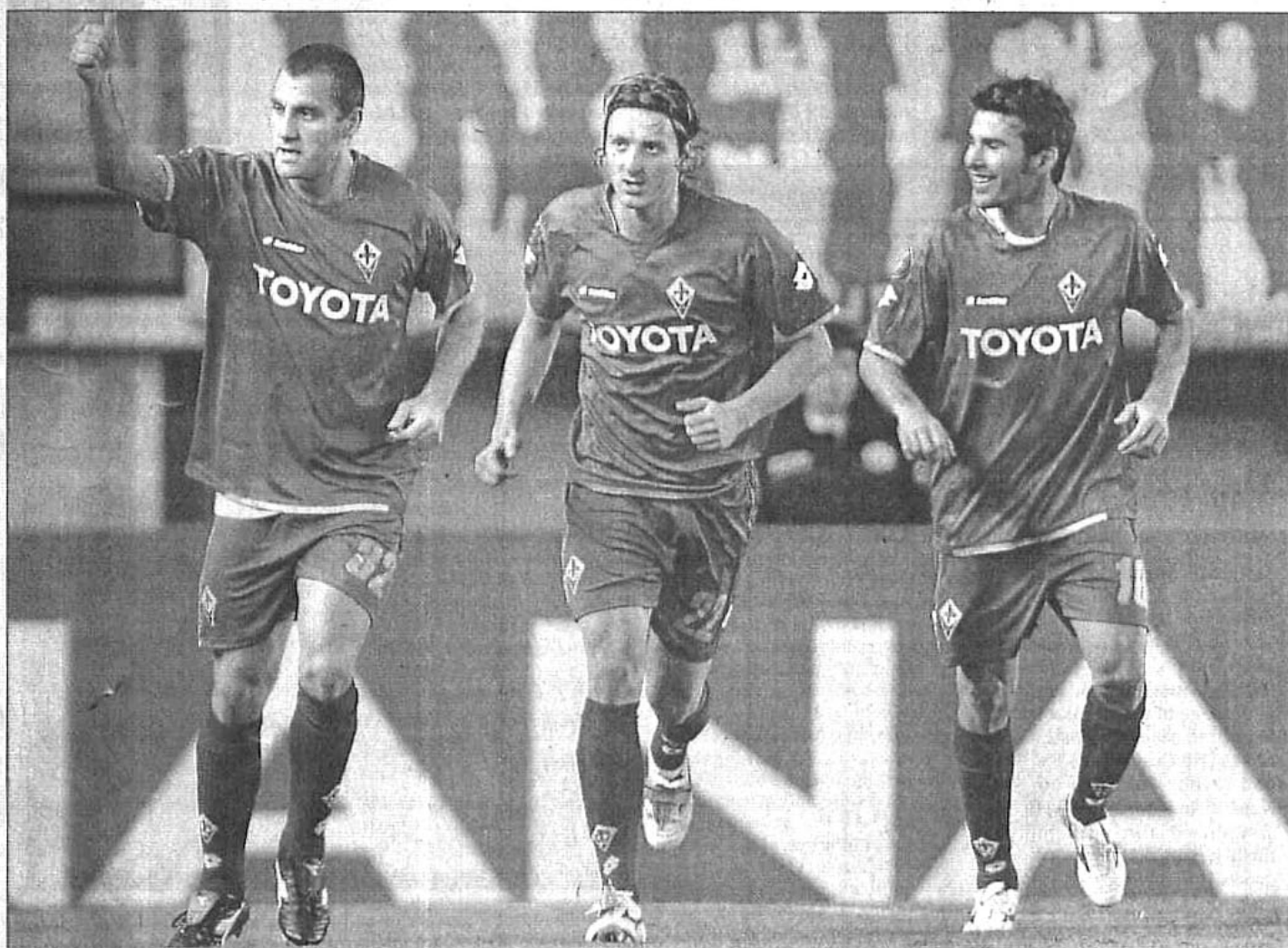
BLAST FROM THE PAST: Fiorentina striker Christian Vieri (L) celebrates his strike that was set up by teammate Adrian Mutu (R) during their UEFA Cup match against Villarreal at El Madrigal on Thursday.