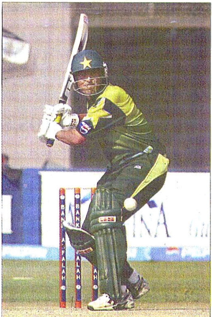
Pakistan batsman Younis Khan gets ready to pull the ball during his 82 against South Africa in the fourth one-day international at the Multan Cricket Stadium on Friday.