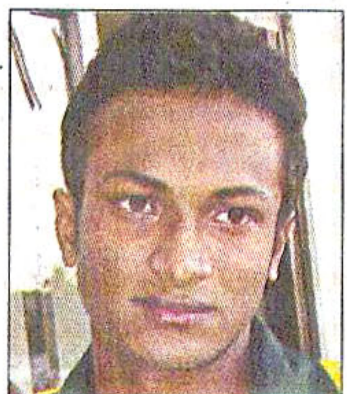
SHAKIB AL HASAN...108

Number five Shakib, whose previous best was 85 in 17 first-class matches, gave only one chance in the nervous nineties but a diving Nazimuddin failed to hold the catch at gully off young paceman Rubel Hossain but was finally caught by Chittagong skipper Ehsanul Haque off Ashiqur Rahman.