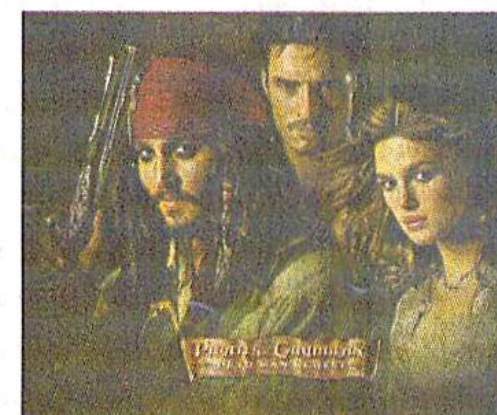
Pirates of the Caribbean: Dead Man's Chest On Star Movies at 7:00pm Genre: Action/Adventure/Comedy Cast: Johnny Depp, Keira Knightley, Orlando Bloom

All programmes are in local time. The Daily Star will not be responsible for any change in the programme.