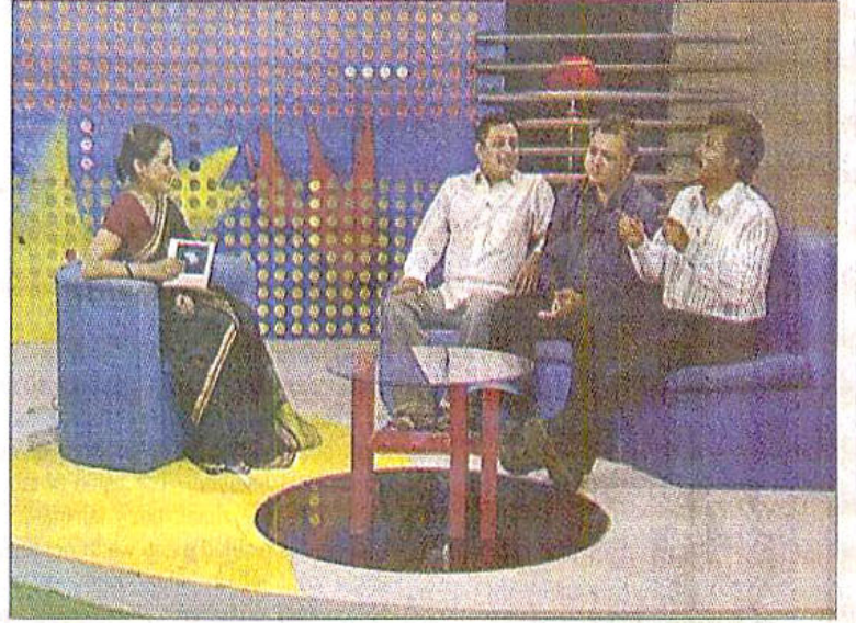
A scene from Amar Ami