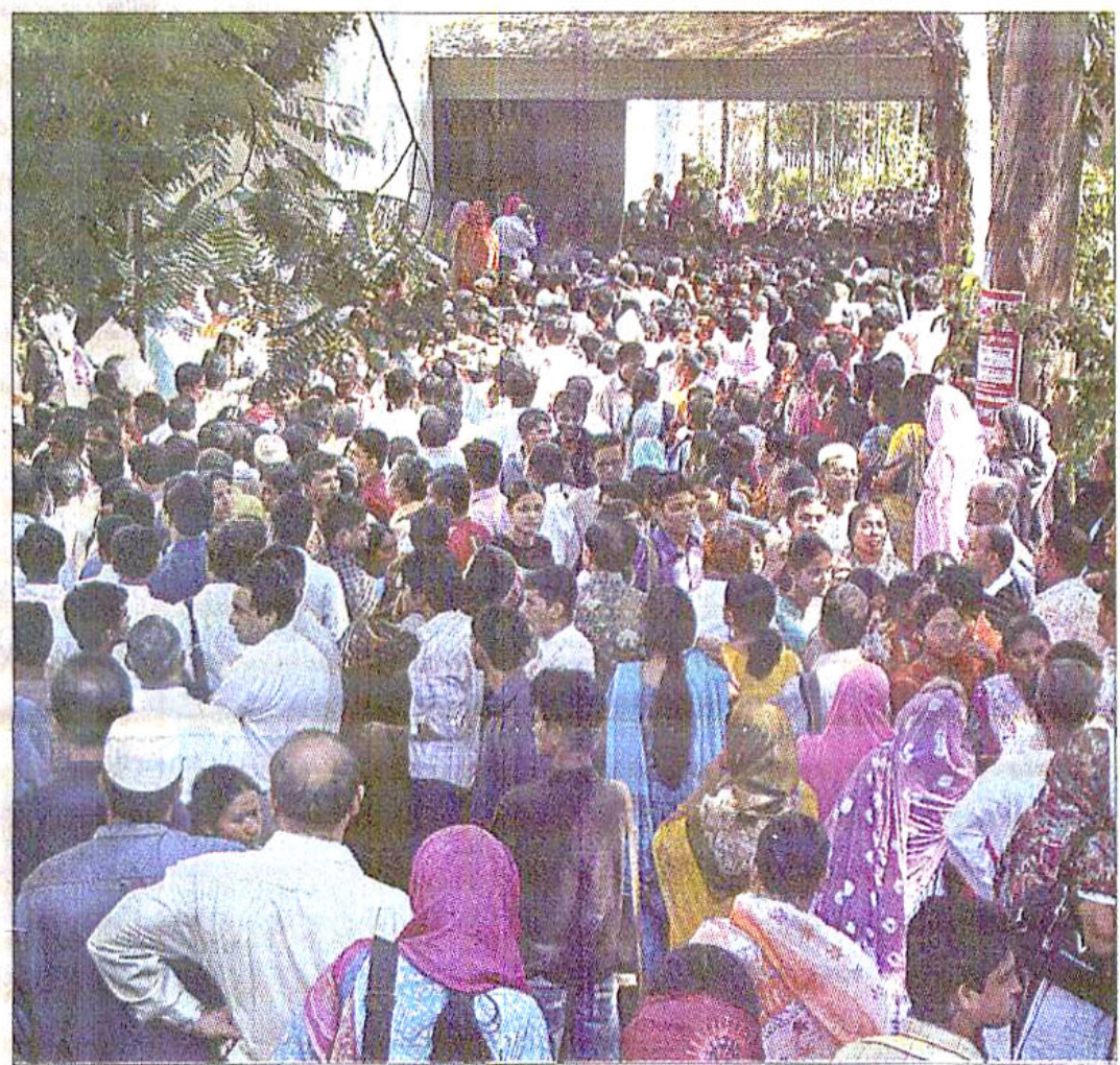
Tensed parents and guardians wait outside the examination halls at DU arts faculty as thousands vie for admission to public medical colleges yesterday. (Story on page 3)