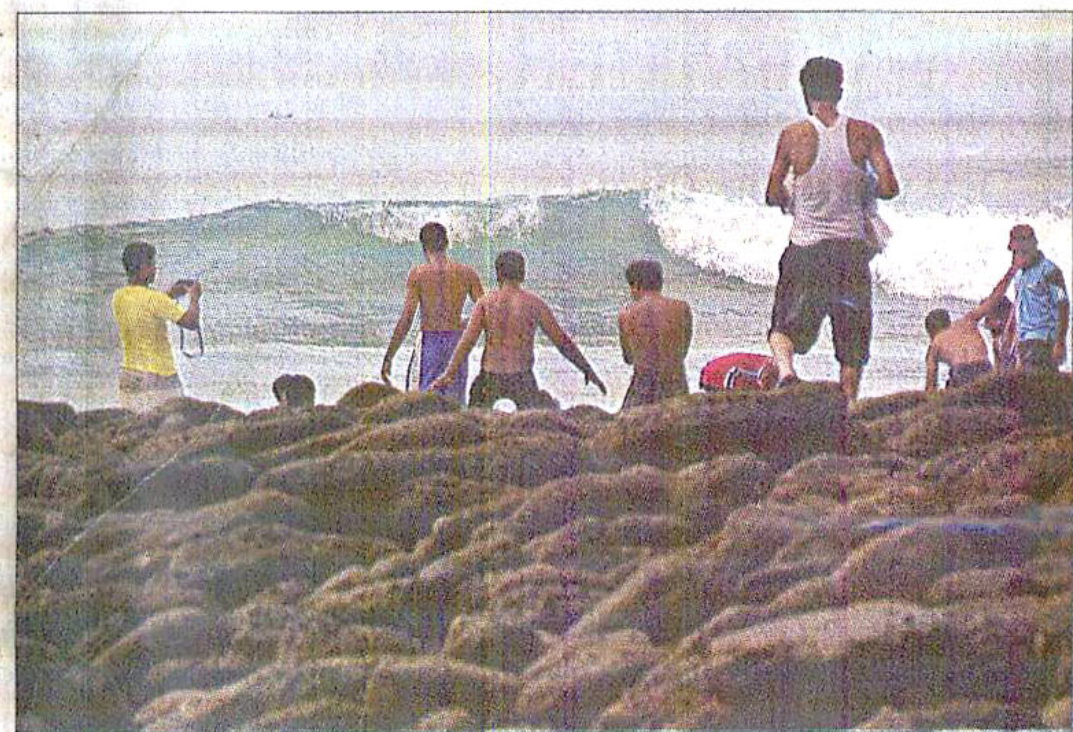
A group of holidaymakers on St Martin's Island.