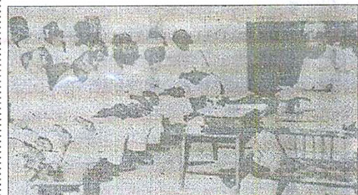
File photos show Golam Azam and Nurul Amin hold talks with Gen Tikka Khan in 1971 to form peace committee (top), Golam Azam faces public wrath in city 1981 (middle) and Maulana Mannan along with madrasa teachers meets Gen Niazi in 1971.