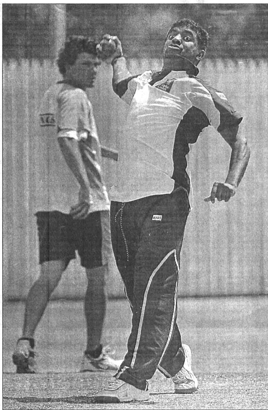
IN HOSTILE LAND: Sri Lankan off-spinner Muttiah Muralidaran in his delivery stride during a practice session at the Adelaide Oval yesterday.

The player also had a highly publicised clash in training last week with his compatriot and fellow Argentine international, Pablo Aimar.