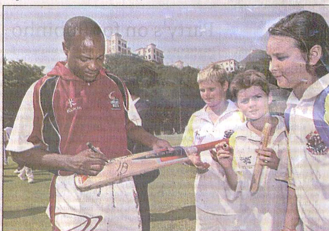
BACK FOR FUN: West Indies great Brian Lara signs autographs for young fans at the Hong Kong Cricket Club on Thursday. The retired West Indies captain will feature in the Hong Kong Cricket Sixes tournament on October 27-28.

"I'm really enjoying my retirement and the last five months have been good, so I have no plans to play for the West Indies again," he said.