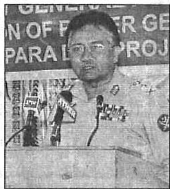
in Swat Valley to counter the activities of pro-Taliban cleric Maulana Fazlullah and his banned Tareekh Nifaz-e-Shariat Mohammedi.

Musharraf's comments came as some 4,000 troops were deployed