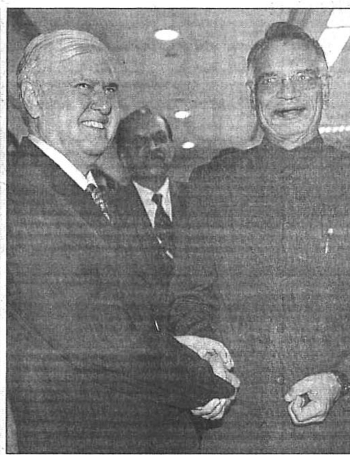
Indian Home Minister Shivraj Patil (R) shakes hands with Pakistani Interior Minister Aftab Ahmed Khan Sherpao (L) during the second meeting of the South Asian Association for Regional Co-operation (Saarc) Ministers of Interior and Home Heads of Delegation meeting in New Delhi yesterday.

"You have made a remarkable contribution to the mediation on the Myanmar issue in the past two weeks, which we appreciate," He said.