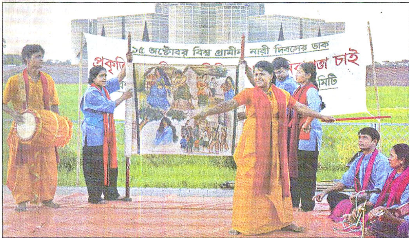
Artists perform at a cultural function in front of the Jatiya Sangsad Bhaban in the city yesterday marking the World Rural Women's Day. Equity and Justice Working Group and World Rural Women's Day Celebration Committee jointly organised the programme.