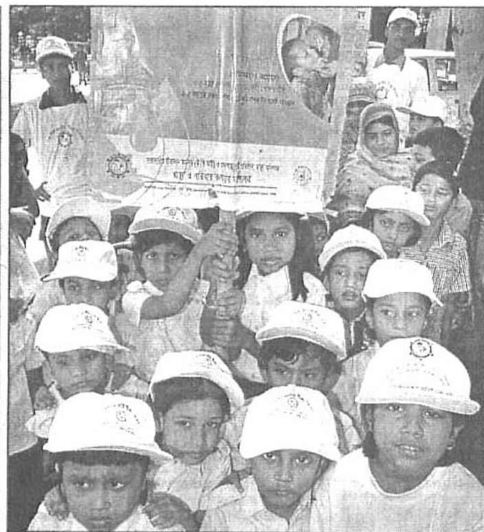
A colourful rally was brought out from Expanded Programme on Immunisation (EPI) Bhaban at Mohakhali in the city yesterday to mark the National Immunisation Day.