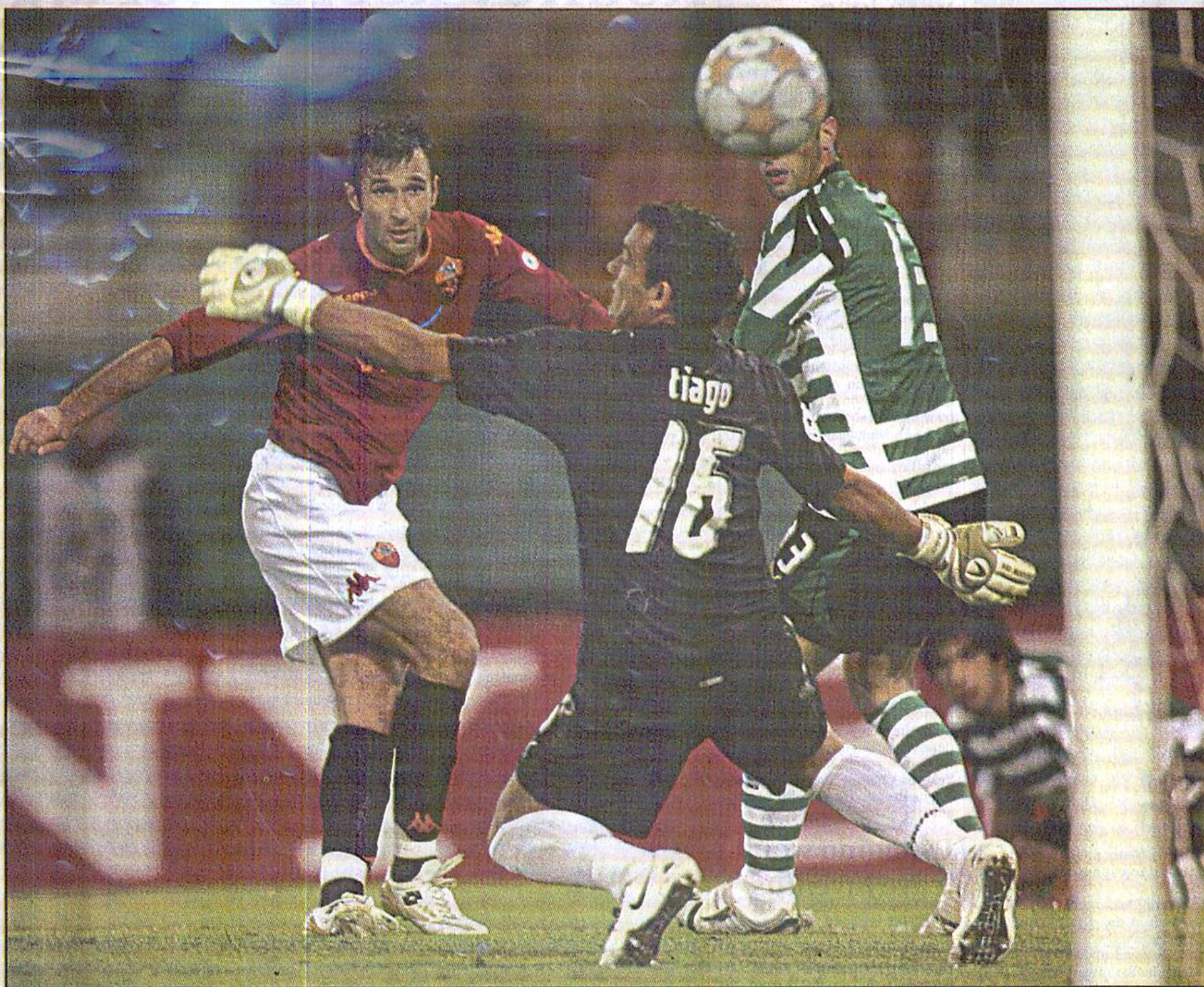
AS Roma striker Mirko Vucinic (L) shoots to score a stunning goal against Sporting Lisbon during their Champions League match at the Olympic Stadium in Rome on Tuesday.