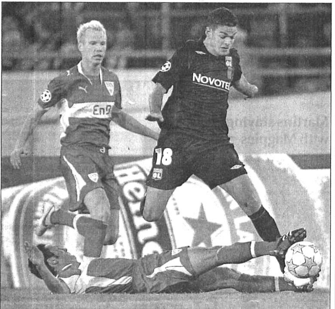
Lyon playmaker Hatem Ben Arfa (R) skips past the challenge of Stuttgart midfielder Yildiray Basturk during their Champions League tie at the Gottlieb-Daimler Stadium in Stuttgart on Tuesday.

But the French team were happy to retreat deep into their own half and see out the game for a maiden win in the tournament this season.