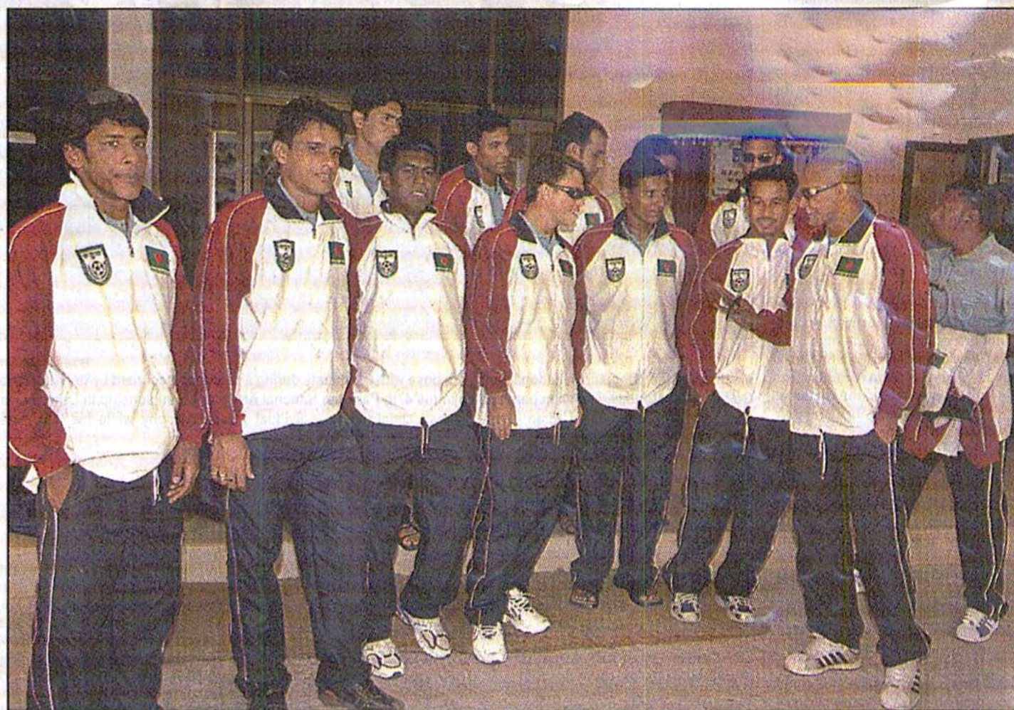
Bangladesh national footballers gather at the BFF Bhawan yesterday ahead of their trip to Tajikistan to play the 2010 World Cup pre-qualifier.

If the Indian -- the least expensive of foreigners to have coached Bangladesh -- leaves now, it is understandable that the federation will go for a face saving recruit shortly before the SAFF Championship, killing any hopes of success in the regional event by starting it all over again.