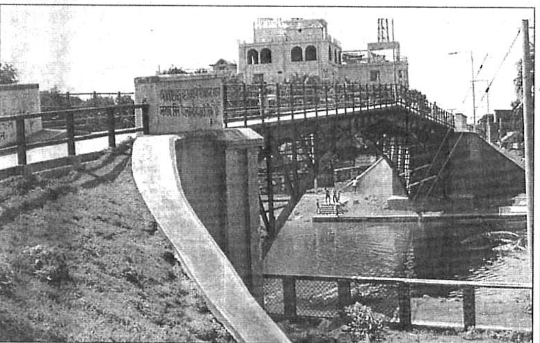
Spectacular Eliot Bridge built over a century ago is one of the tourist spots in Sirajganj town.