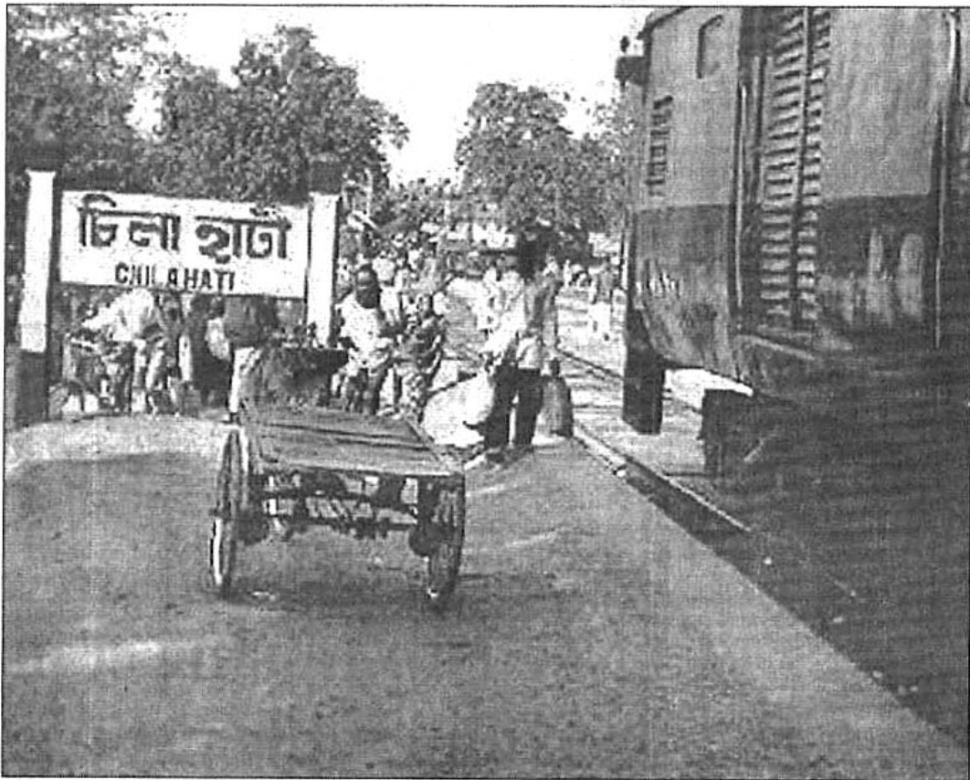
A train waits at the country's northernmost bordering railway station at Chilahati. Development of 11.34km of railway in Bangladesh and Indian parts would help boost regional trade.

port will help to accelerate economic activities among the Saarc countries, Abu Musa, convenor of Chilahati land port implementation committee, said.