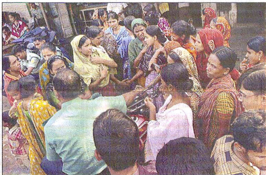
Workers of Nassa Mainland, a garment factory, gather outside the factory at Tejgaon in the city yesterday as the authorities did not allow them to enter into the factory. (Story on Page 2)