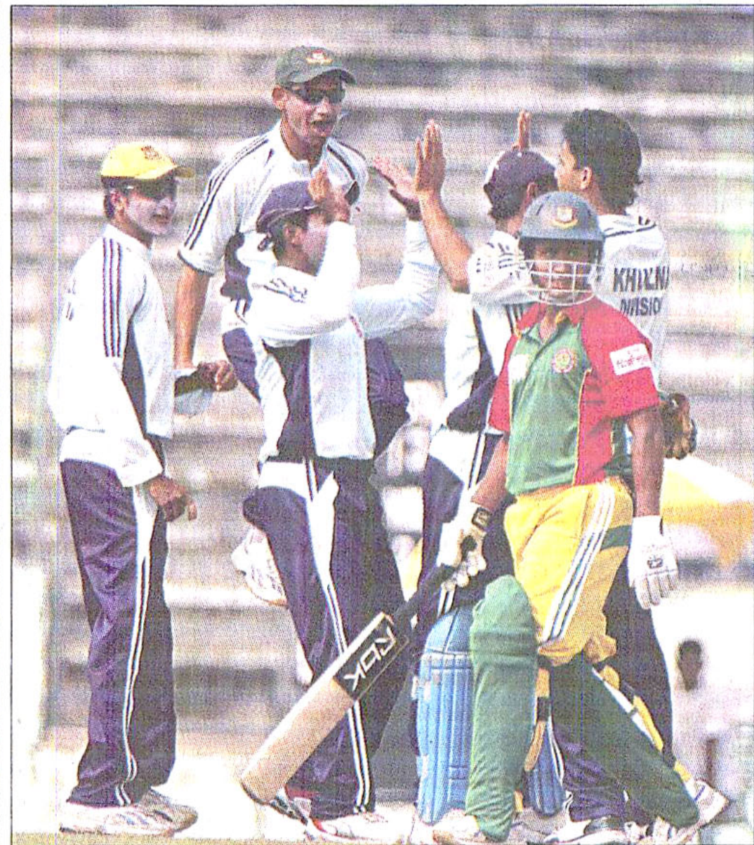
JOB HALF DONE: Khulna players unite to celebrate the fall of Dhaka captain Mohammad Ashraful's wickets during the one-day match of the National Cricket League at the Sher-e-Bangla National Stadium in Mirpur yesterday.