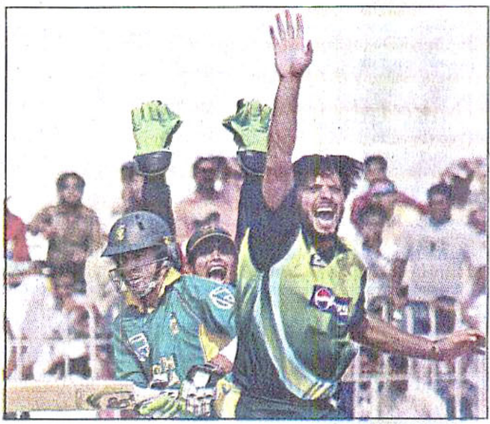
MAN-OF-THE-MATCH: Pakistan all-rounder Shahid Afridi (R) and wicketkeeper Kamran Akmal (in the background) appeal for a low decision against South Africa's AB de Villiers during the third one-day international at the Iqbal Stadium in Faisalabad yesterday. Though the appeal was not successful, Afridi still claimed three wickets for 37 before hitting a gusty 32 off 18 balls.