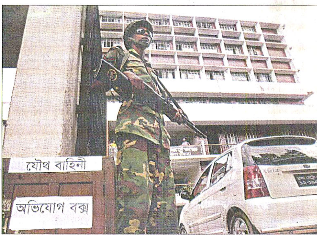
The army-led Task Force against Crime and Corruption yesterday stormed into the National Housing Authority Bhawan in Dhaka, set up a temporary office and installed a complaint box to monitor activities of the housing authority.