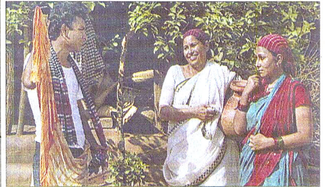
A scene from Kabor

Kabor will be aired on November 2 at 8 pm on ATN Bangla.