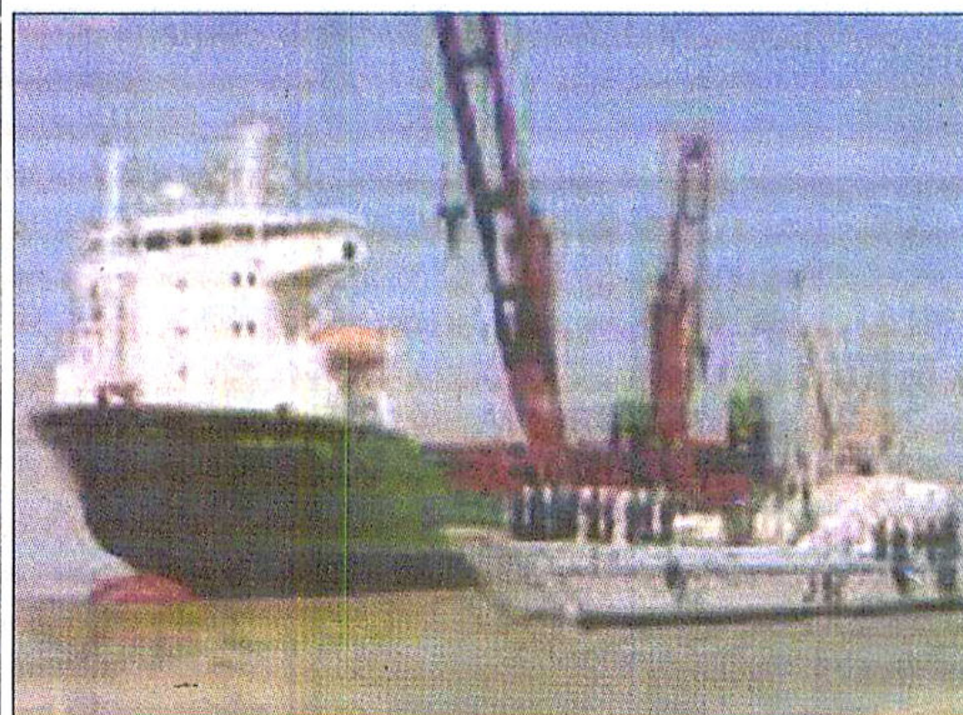
Bangladesh Navy Ship 'DARSHAK' leaves for UN Peacekeeping Mission in Sudan by a UN chartered transport vessel MV SCAN OCEANIC from Chittagong port yesterday.