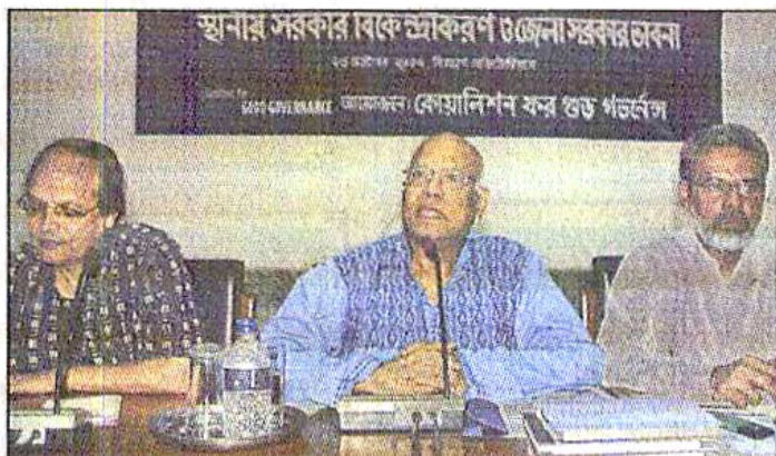
Former finance minister Abul Maal A Muhit speaks at a seminar at the Cirdap auditorium in the city yesterday. On his right is economist Dr Atiur Rahman and on his left is LDP leader Feroj M Hasan.

"District government should be established for strengthening the local government. There should be three tiers of local government, Zila (district), Upazila and Union level. The division is an unmanageable unit and it could be considered only if we want to set up a federal government with several prov-