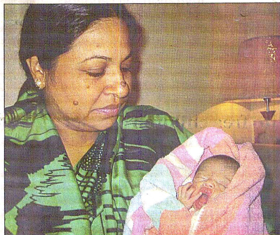
The first test-tube baby was born at Square Fertility Centre in the city on September 30.

On the 62nd commemoration of the United Nations Day, he said, "Bangladesh reiterates the significance of the UN as the central and only viable organ for building of a safer and better world."