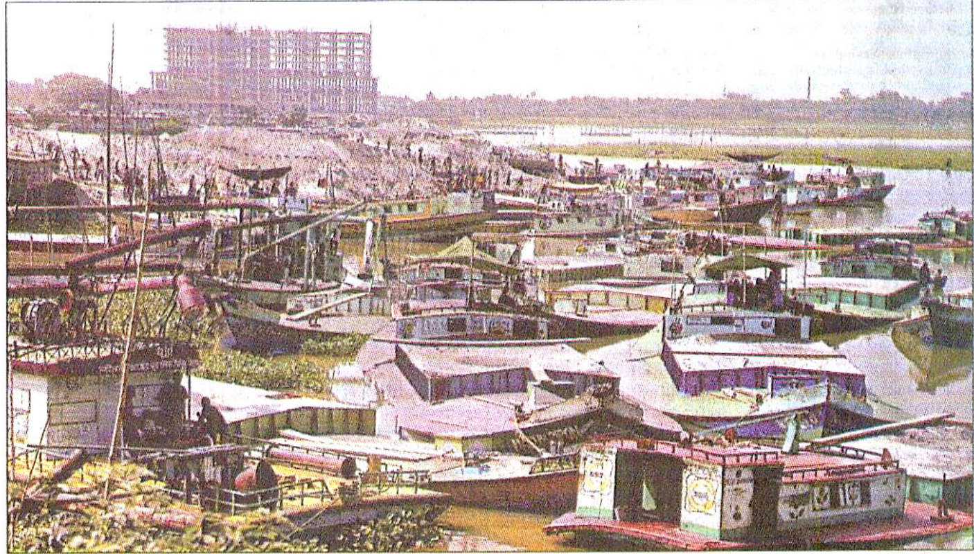
Sand traders running business on the Turag near the Biswa Ijtema ground in Tongi, substantially narrowing the river, which thousands of pilgrims use for ablutions during the largest religious gathering of the country.