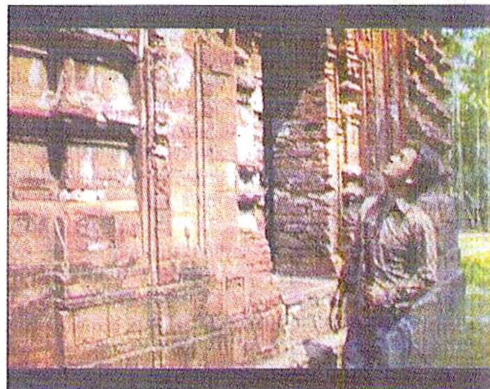
A scene from Abiram Bangladesh

The show focuses on the history and heritage of the places as well. Apart from featuring the popular tourist spots, the show also focuses on nature, local people, their lifestyle and culture, special cuisines etc. The programme will provide information on how to reach the site, where to stay and more.