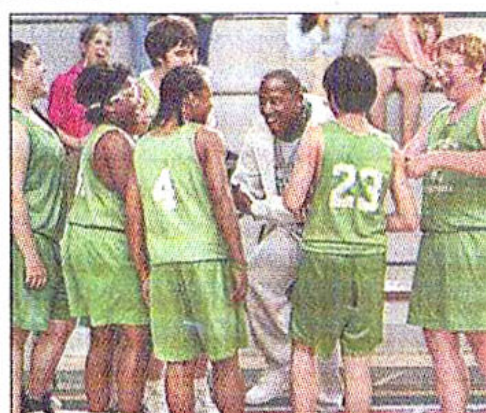
Rebound On Star Movies at 7:00pm Genre: Comedy Cast: Martin Lawrence, Wendy Raquel Robinson

All programmes are in local time. The Daily Star will not be responsible for any change in the programme.