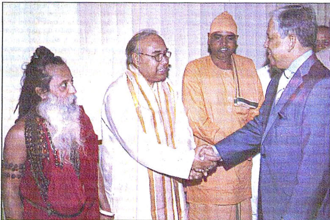
Chief Adviser Fakhruddin Ahmed exchanges greetings with members of the Hindu community at his office in the city yesterday on the occasion of Durga Puja.