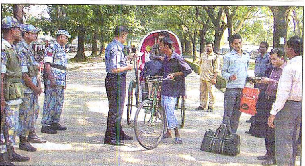
Students of Chittagong University show their identity cards to law enforcers at the main gate of the university as the dormitories reopened yesterday.