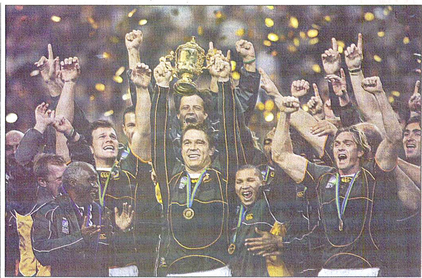
South Africa captain John Smit (C) holds aloft the Rugby World Cup trophy as President Thabo Mbeki (2nd from L) and team members applaud after they beat England in the final at the Stade de France in Paris on Saturday.