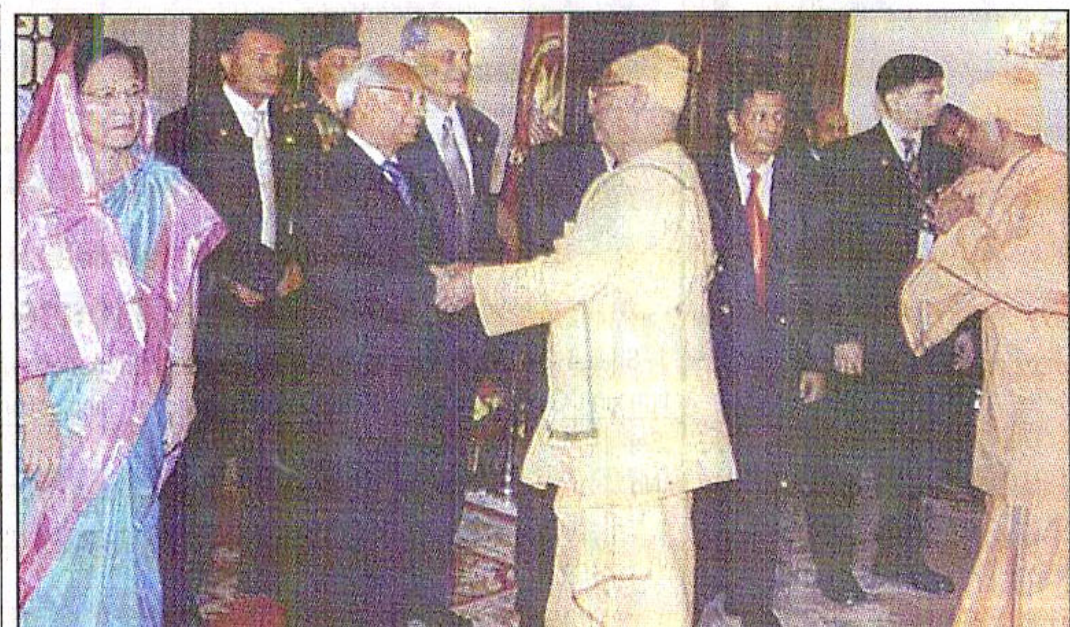
President Iajuddin Ahmed exchanges greetings with members of the Hindu community at a reception at Bangabhaban yesterday on the occasion of Durga Puja, the largest religious festival of the Hindus.