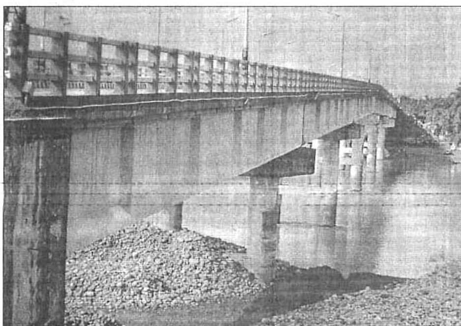
The Shahjalal Bridge-III, left, over the Surma river on Sylhet bypass highway cannot be opened for traffic as its southern approach road remains incomplete for over a year.