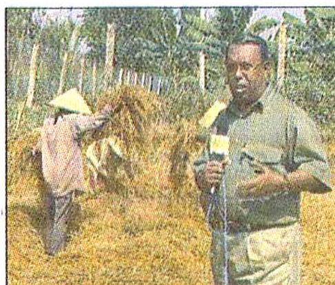
Hridoye Mati O Manush