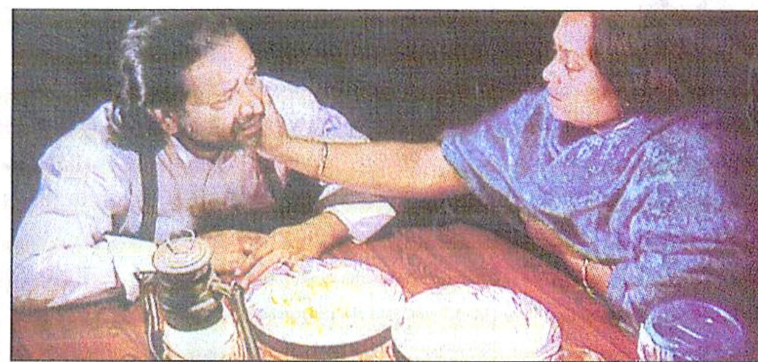
A scene from the film