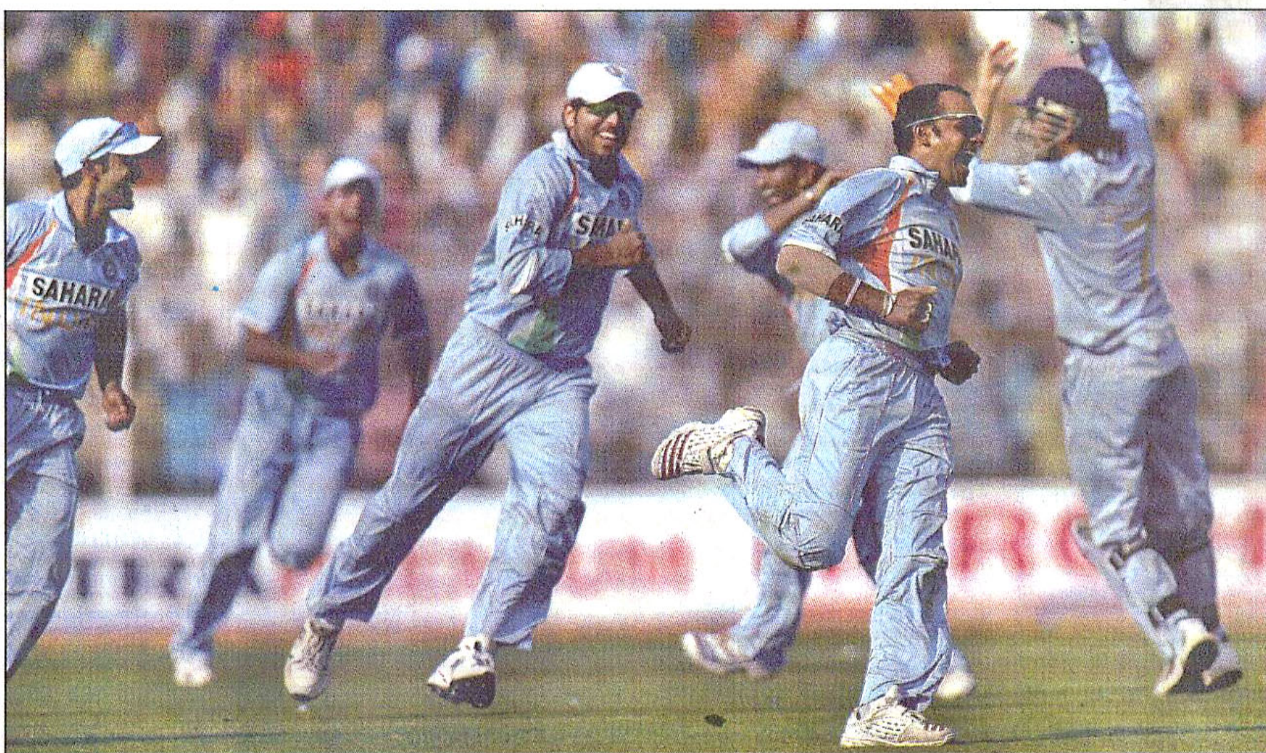
SIX-SHOOTER KARTHIK: Indian left-arm spinner Murali Kartik (2nd R) celebrates the wicket of Australia batsman Andrew Symonds (not in picture) during the final one-day at the Wankhede Stadium in Mumbai on Wednesday.