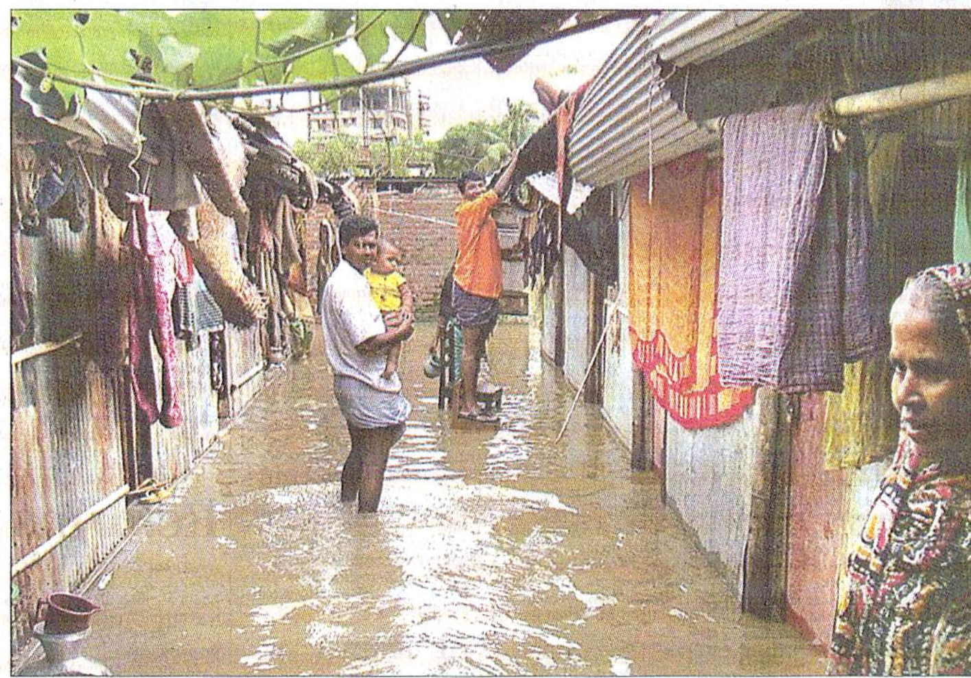
Different areas in Chittagong including Agrabad and Shantibagh are still under water as heavy downpour inundated most parts of the port city recently.