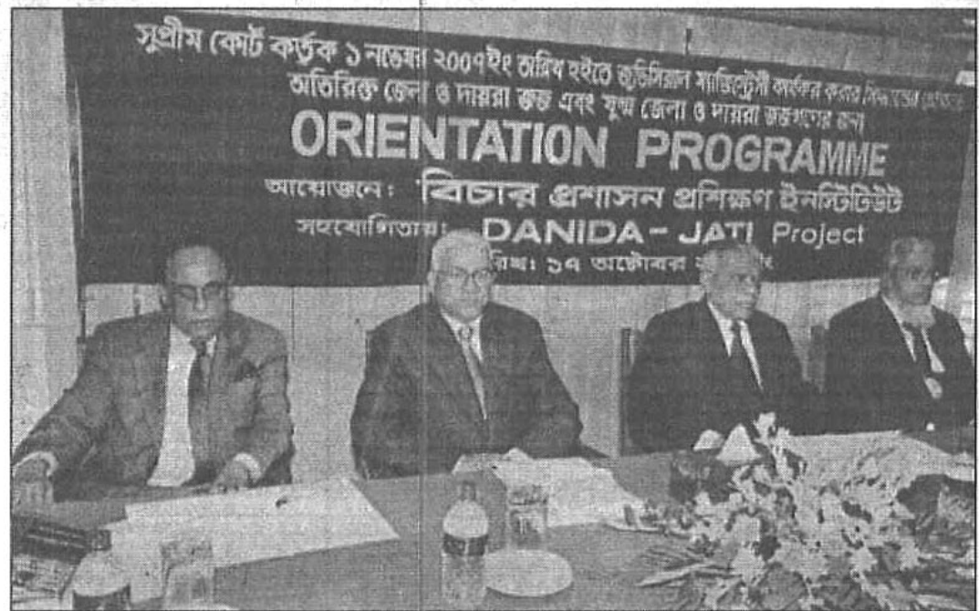
Chief Justice Md Ruhul Amin and Law and Information Adviser Mainul Hossain attend as chief and special guests an orientation programme for additional district and sessions judges and joint district and sessions judges in the city yesterday. Judicial Administration Training Institute organised the programme. (Story on Page 1)

District officials, among others, were present at the meeting.