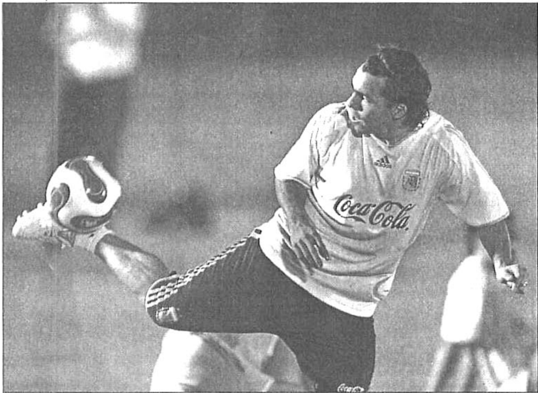
Argentine striker Carlos Tevez controls the ball during a training session in Maracaibo on Monday. The second round of World Cup qualifiers, that began Tuesday, will continue today.